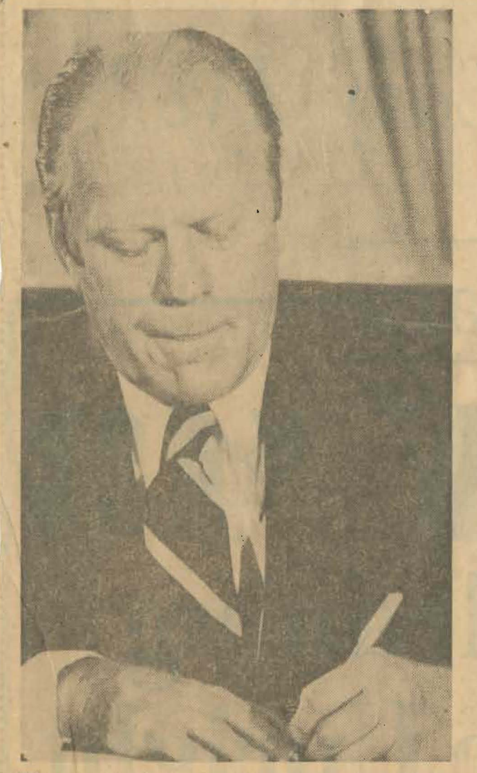
The president signing Nixon's pardon: Only 200 or 300 collectors possess the actual signature of the new chief executive.