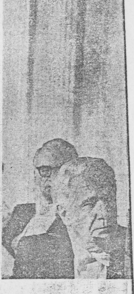
At last night's White House dinne soner, Queen S