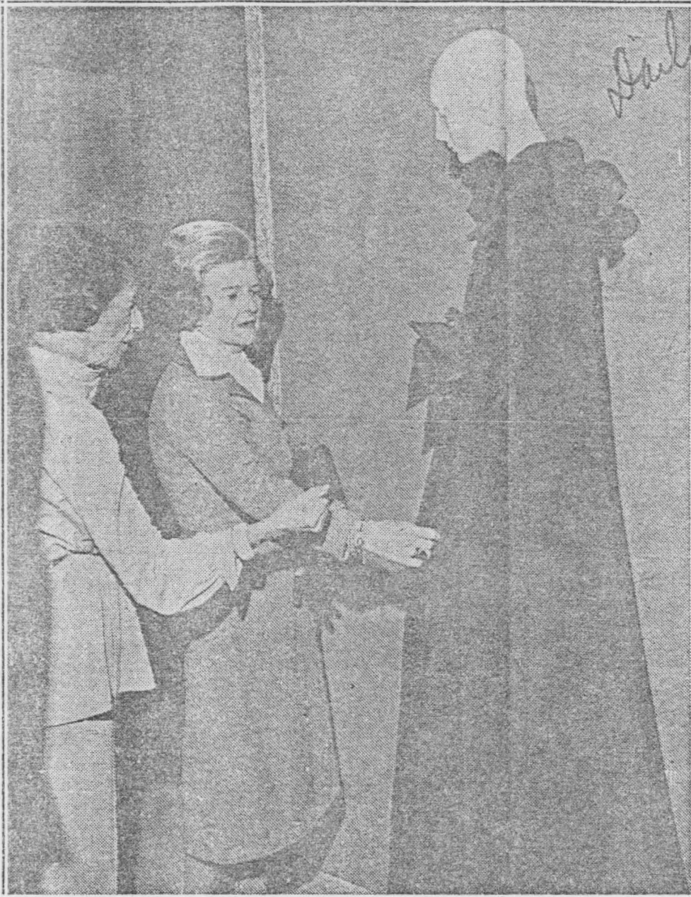
Diana Vreeland explains gowns worn by Isadora Duncan in '20's.