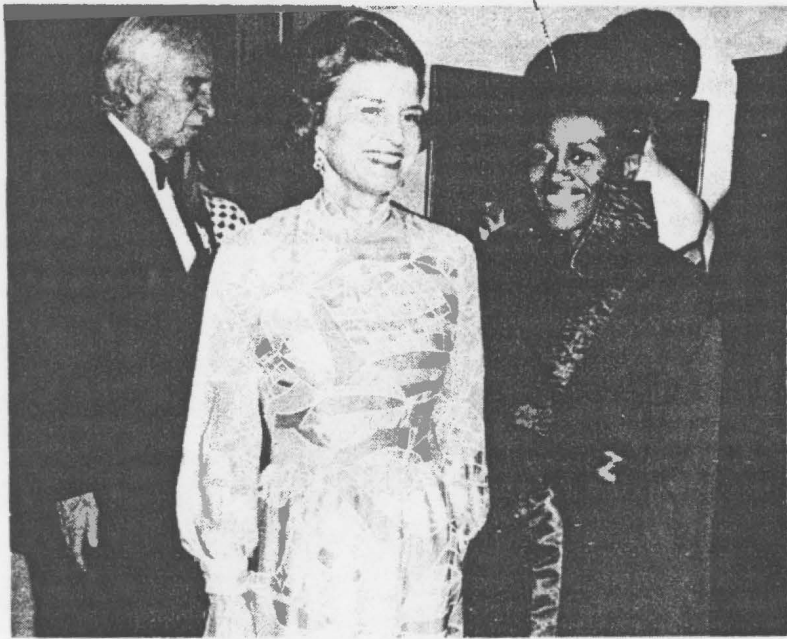
Betty Ford and Cicely Tyson