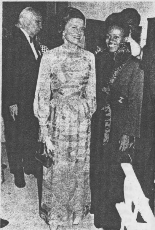
Betty Ford and Cicely Tyson