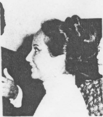
and Merle Oberon