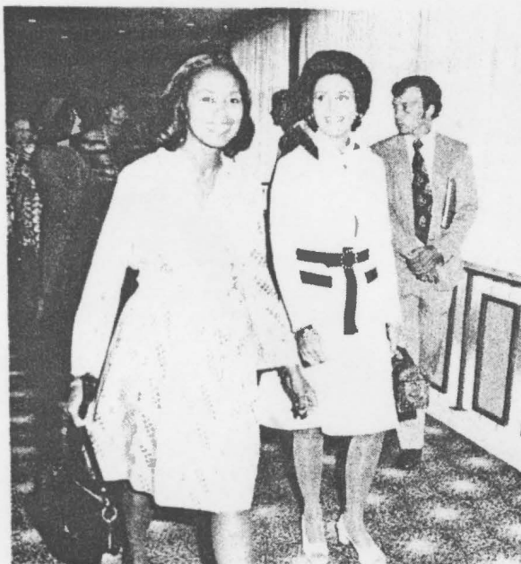
Yvonne Braithwaite Burke and Cornelia Wallace