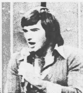
Crooner Jimmy Connors: He left Chrissie in tears