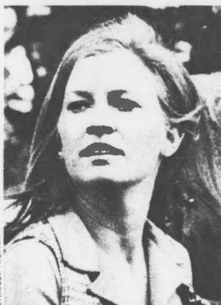
Photographer Susan Ford: No close-ups, please

Bloodshot Eye Is it possible that Washington Post social commentator Sally Quinn can dish it out better than she can take it? Her recently published explanation for her five-month bomb-out at CBS, We're Going to Make You a Star , has not totally convinced all the book reviewers. Was her problem no classes? The wrong glasses? A producer's passes? Quinn, 34, dismisses those who dare pan her apologia as part of "a pattern. They're written by unmarried, middle-aged