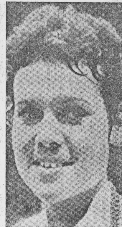
Evonne Goolagong Cawley

The word came out last night at a reception at Blair House, hosted by