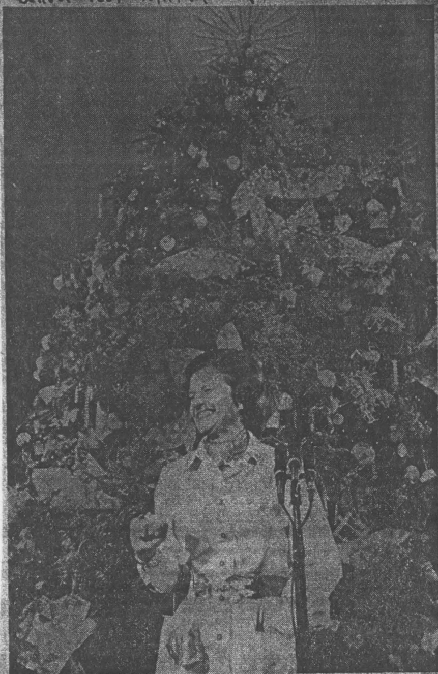
BETTY FORD DISPLAYS THE WHITE HOUSE CHRISTMAS TREE

An "old-fashioned theme" and handmade ornaments are featured this year.