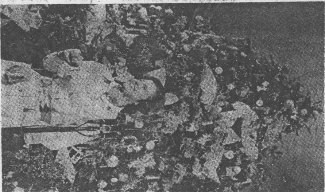
10 THE TIMES Wednesday, December 11, 1974