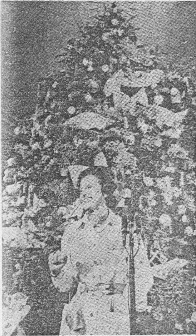
Mrs. Ford shows White House tree.