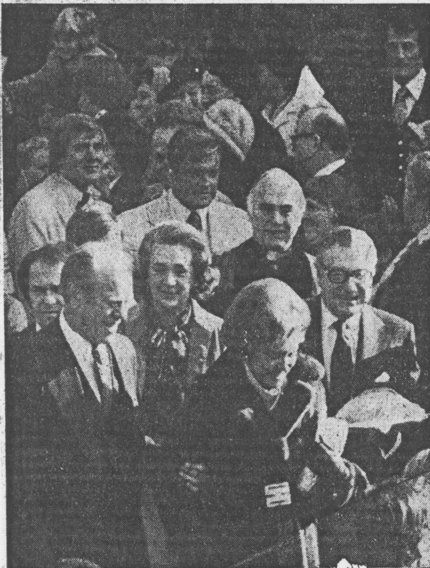
President and Mr. Ford with Vice President Rockefeller after services at Union Church in Pocantico Hills, N.Y.