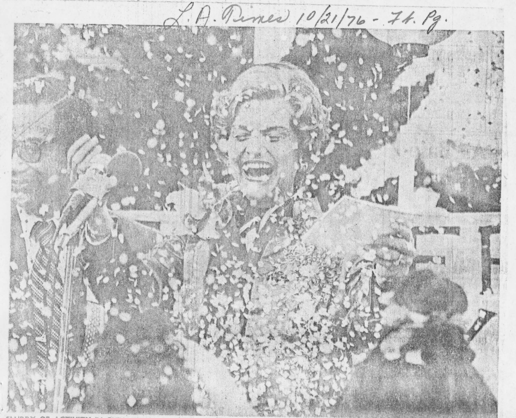
FLURRY OF ACTIVITY IN CHINATOWN-Betty Ford as she was showered with confetti after making campaign stop for President.