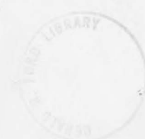
President and Mrs. Ford enjoying their "Anniversary Waltz" serenade.