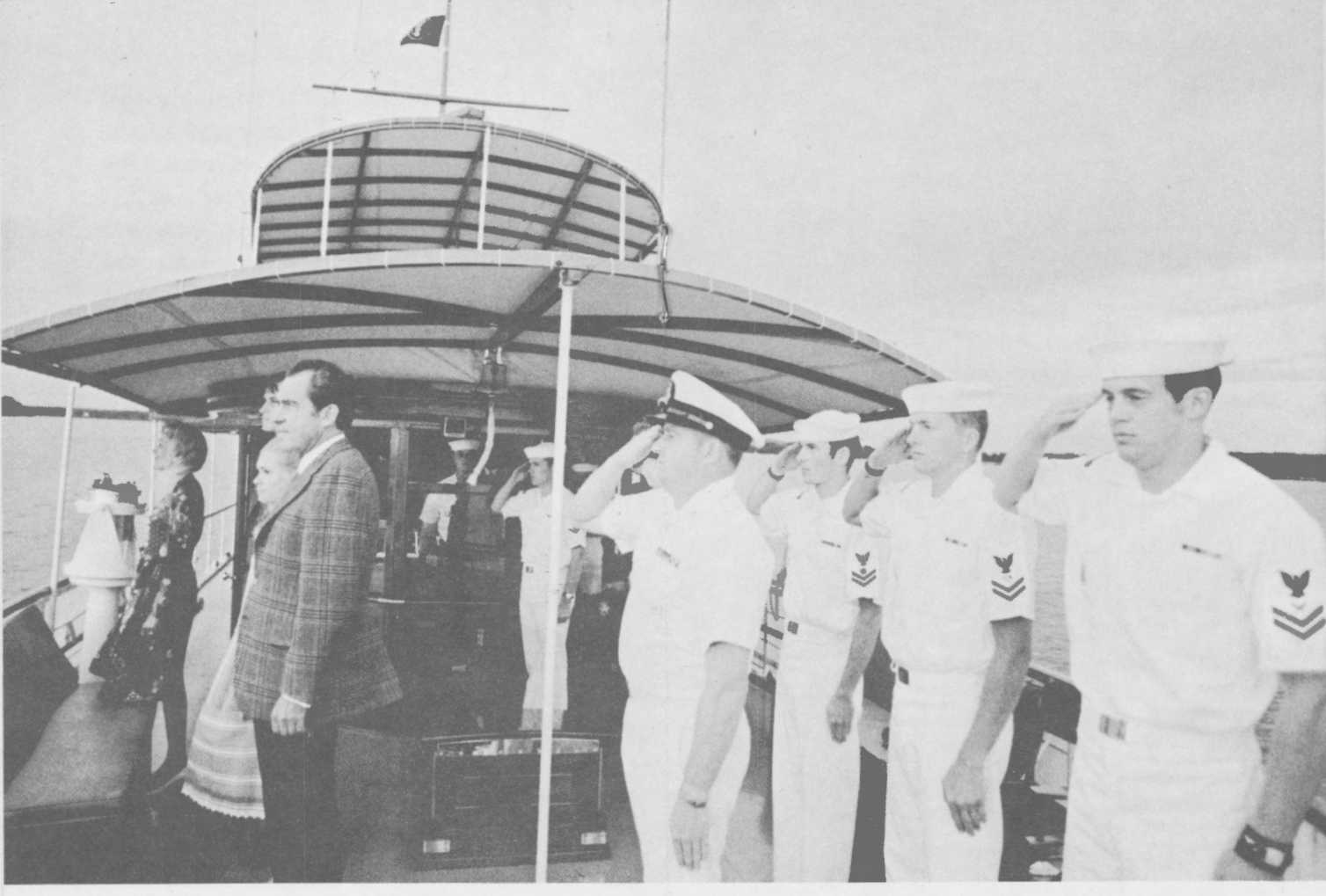
The President, members of the first family and crew observing honors on board Sequoia