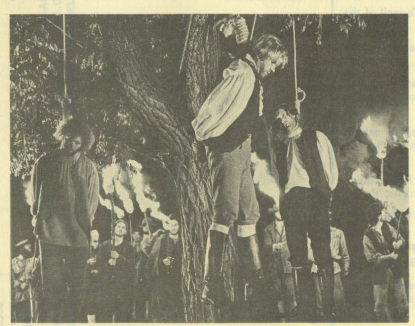
SOME HUNG UP Southern Tories meet justice at the hands of the Overmountain Men for acts of violence against the civilian populace in National Geographic's film, "King's Mountain."

A widely-circulated Associated Press wire service story reported the price tag for the program as $2 million. But Penney's officials say that the figure is much too high, that they do not know how the erroneous report got started, and that it is impossible to estimate the dollar cost of the program.