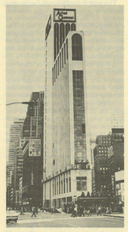
THE AMERICA CENTER will occupy the first two floors of the Allied Chemical Building at the heart of New York City's Times Square.

If the America Center project comes to fruition-and it seems well on its way with the acquisition of the Allied Chemical Building space-it should give focus to the idea that New York City is the gateway to the United States and the gathering place for much of what is best in America. And it should provide a place where something will be happening each day during the Bicentennial Era. As such, it would attract New York area residents as well as tourists.