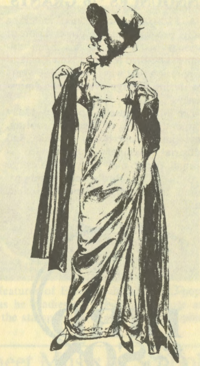
LOGO ILLUSTRATION for the "American Woman" filmstrip shows an early 19th-century look.

Designed for classroom use, the documentary outlines the evolution of fashion-what women wear and why they wear it, where styles come from and how they become popular. The filmstrips are supplemented by a soundtrack on tape cassettes, a Teacher's Guide, and a wall chart-the whole