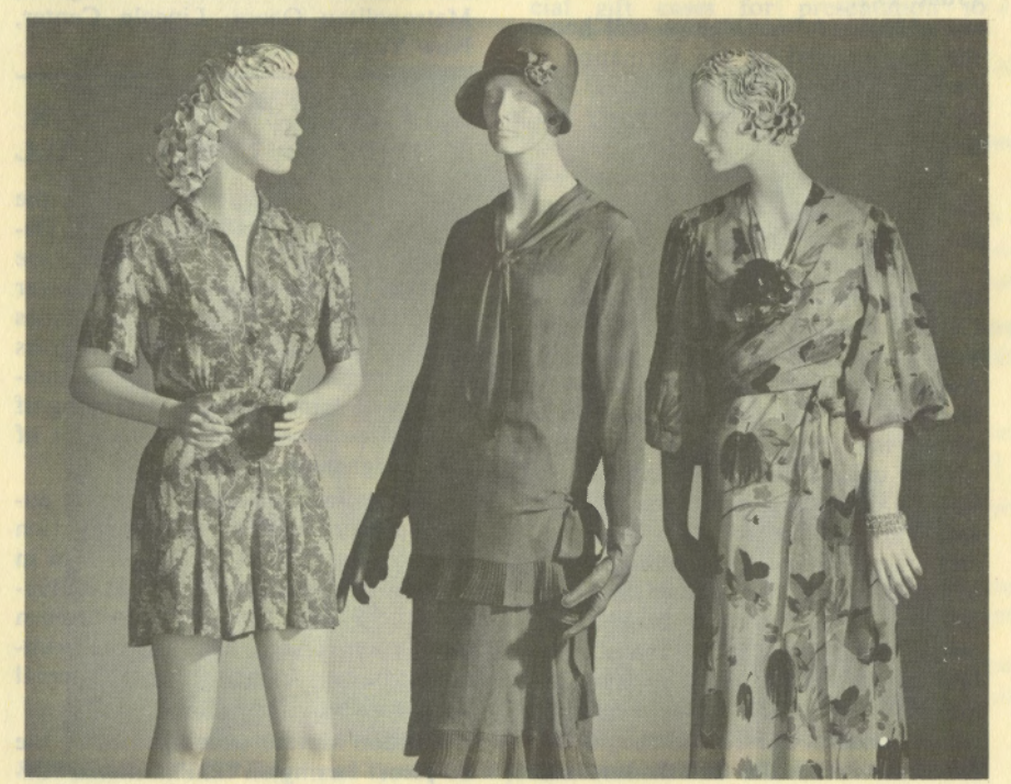
SMITHSONIAN EXHIBIT display illustrates women's fashions by decade, from left: 1920, 1930, 1940; and (also from left) mini, midi, and maxi.

So we will all have a chance to learn about the history of American clothing during the Bicentennial. We may also have a chance to purchase massproduced colonial clothes in our department stores - fichus, petticoats, bonnets, and mantelets come to mind: and breeches, waistcoats, cravats, and cocked hats - some of the once-new fashions that must have stirred the imaginations of the colonists when the "Fashion Babies" (dolls about a foot high, meticulously dressed in London and Paris styles and serving the same purpose as our fashion magazines, arrived each month from Europe.