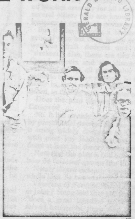
Self-exiled draft evaders, living in Toronto, listen to Mr. Ford's words on clemency.

States and must check in with the U.S. attorney in his home district within 15 days. There are one to four of these federal officials in each State—98 in all. The U.S. attorney will consider each case, and set the period of time—up to two years—for "alternate service."