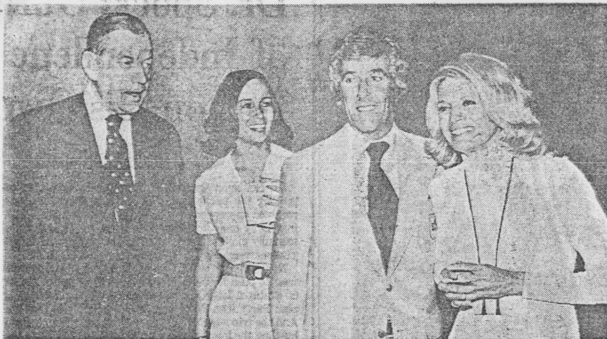
ALL TOGETHER NOW —Gathering for a rally 'round meeting on upcoming Good Samaritan