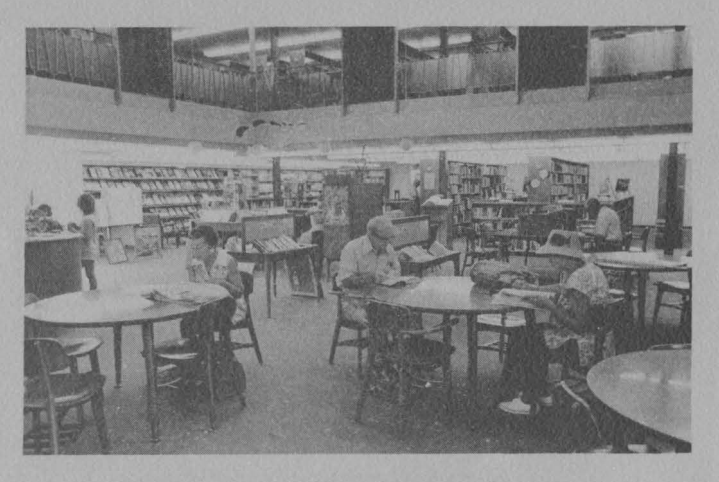
Library: A Fine Place to Relax