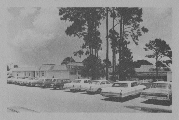
Senior Lounge for Sociability