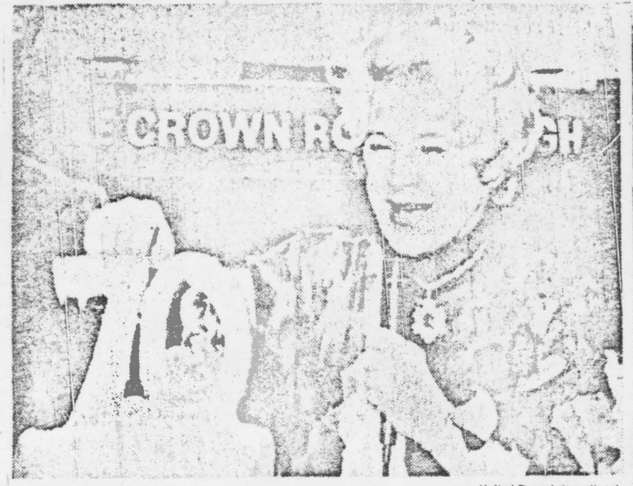
United Press International