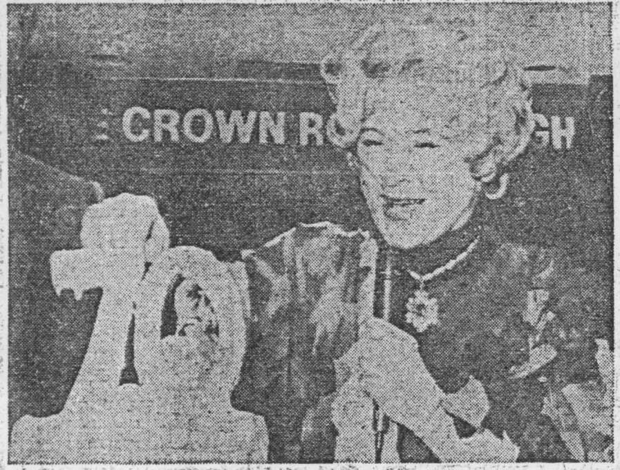
United Press International