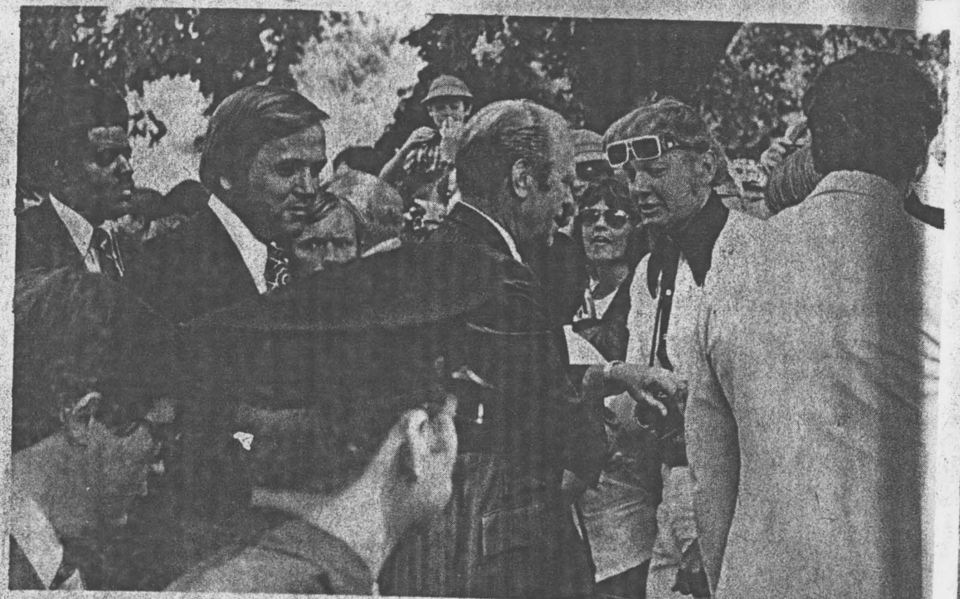
After church Ford circulated shaking hands and greeting the people waiting to see him.