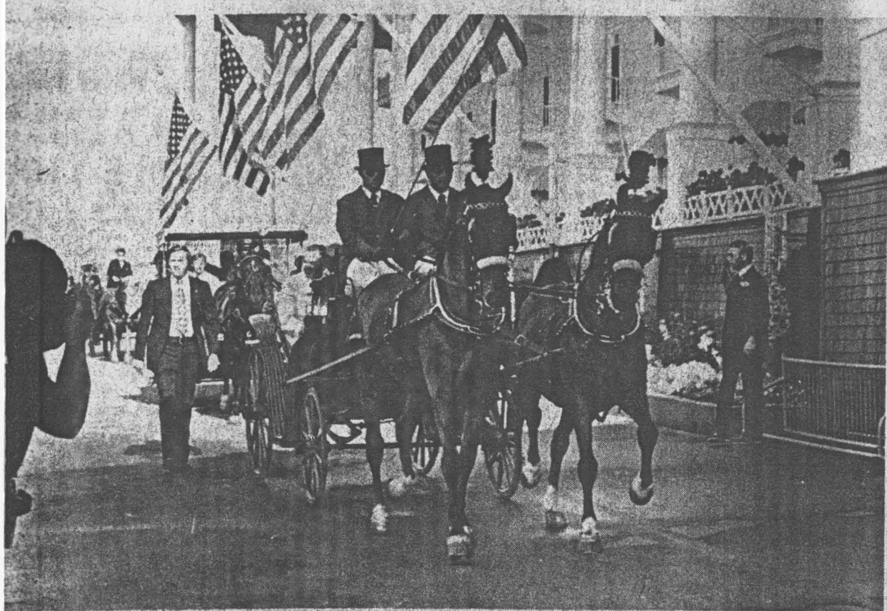
lent Ford and Governor Milliken arrived at the Grand Hotel at 8:45 Sunday morning to s the 6th Circuit Court of appeals meeting. The coach and team they arrived in was d at $40,000.