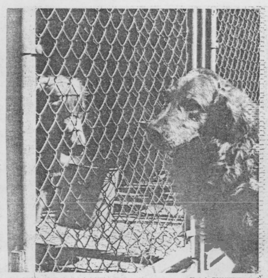
NUPTIALS — Liberty (left), presidential family pet, greets her mate-to-be-Misty's Sungold Lad, through kennel fence in Phoenix, Ore. Lad, owned by