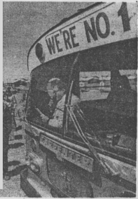
continued next page