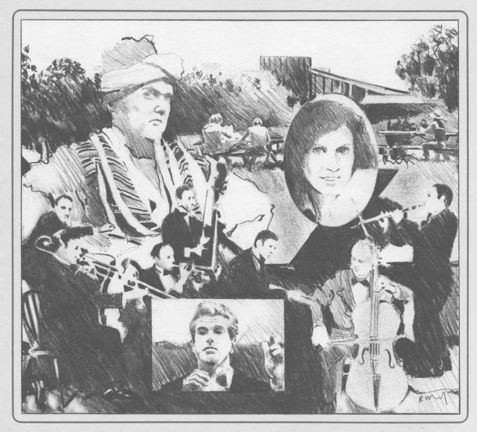
JULY 3-JULY 26 · 1975 · VOLUME II