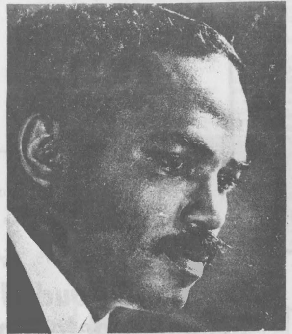
Info On The Sun...

The sun is known to be the major cause of skin cancer.