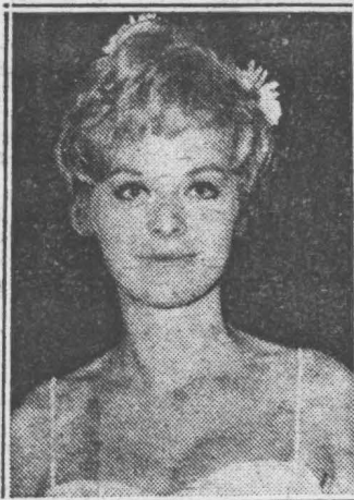
Susannah York Starts a "second life"

Committee, which is considering her appointment to the White House job. As protocol chief, Mrs. Black, who has served as ambassador to Ghana since 1974, would represent the White House in its relationships with the foreign diplomatic corps in Washington.