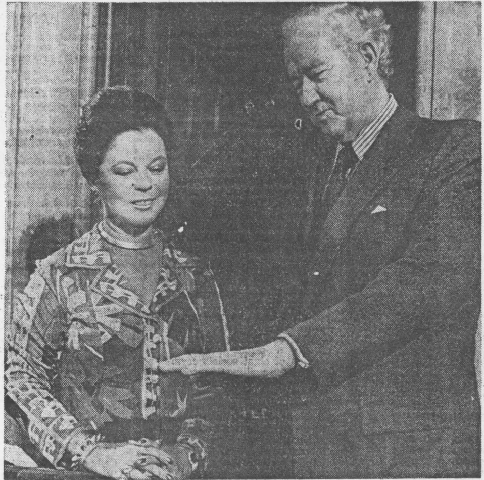
Shirley Temple Black with Senator John J. Sparkman, Senate Foreign Relations Committee

If she is approved as chief of protocol for the State Department, Shirley Temple Black told the Senate Foreign Relations Committee yesterday, she looks forward to "shaking up anything I see that needs shaking up." The former child actress, who has been serving as Ambassador to Ghana, said, "I'm pleased to be the first woman in 200 years to hold this job." And, she promised the committee, "I'm energetic, I'll work hard." Her confirmation by the Senate seemed assured.