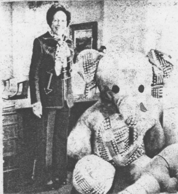
Anne Armstrong and friend in Washington days

While she hopes to bring the openness of Texas to the Court of St. James, she is willing to temper her breezy informality if the job requires. "I don't want to be phony, but if doing the job means I have to lower my voice a decibel, I will work at it."