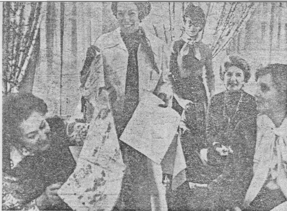
Ambassador Armstrong meets the press and presents them with scarves which delineate map of her Texas ranch.