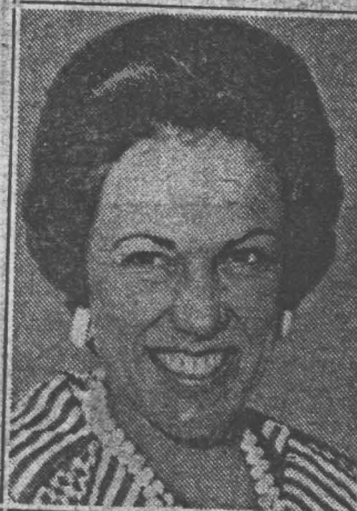
Anne Armstrong She was on the line

London — United States AMBASSADOR ANNE ARMSTRONG spent 55 minutes "live" on British Broadcasting Corp. microphones yesterday morning, answering questions phoned in by listeners to a program called "It's Your Line." She fielded several complaints, including one from a woman who said that red