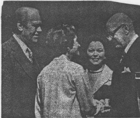
SHIRLEY TEMPLE BLACK WITH THE FORDS AND FINNISH PRESIDENT KEKKONEN