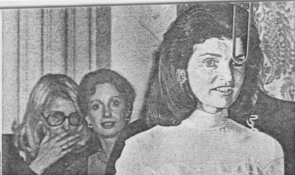
WASHINGTON POST SNIPSTER SALLY QUINN (LEFT) HOVERING NEAR THE BIGGIES