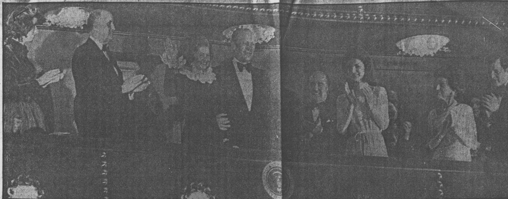
The Kennedys clapped for La Onassis and Le Orfila, who clapped for the Kissingers who all clapped (along with Ear) for the President and his Lady.