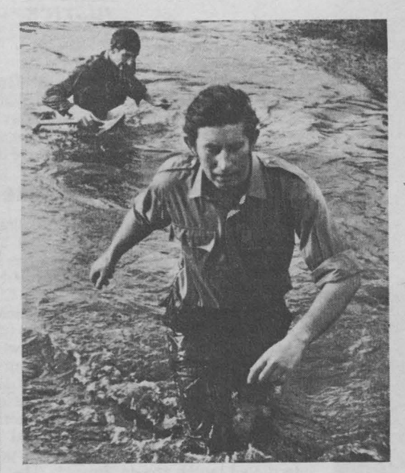
Prince Charles: Taking it in stride