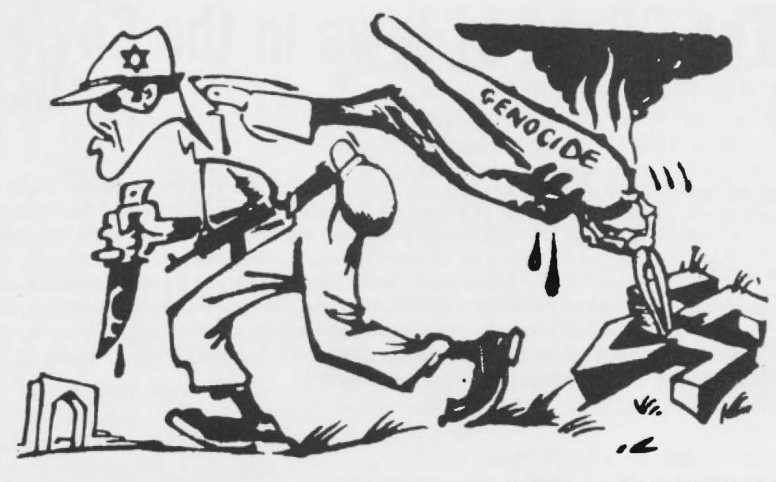
The aggressor's relay baton.

Bakinski Rabochi/Baku, Azerbaijan SSR/June 23, 1967