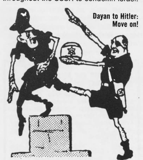
Kazakhstanskaya Pravda/ Alma Ata, Kazakh SSR

The Six-Day War of June, 1967, however, triggered an anti-Jewish reaction of major proportions throughout Eastern Europe. A flood of anti-Zionist materials, with strong anti-Jewish overtones, poured out over the mass media. A great number of meetings was held throughout the USSR to condemn Israel.