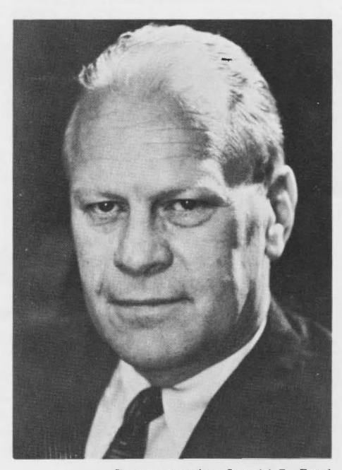
Representative Gerald R. Ford

Jews in Russia are denied even the meager religious facilities permitted non-Jewish minority groups. Pressures against the Jewish people have been intensified following the defeat by Israel of the Russian-backed Arab aggression. When the USSR severed diplomatic relations with Israel last June all exit visas for Jews were abruptly cancelled.