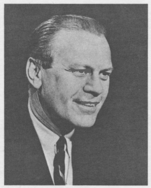
HON. GERALD FORD U. S. Representative of Michigan