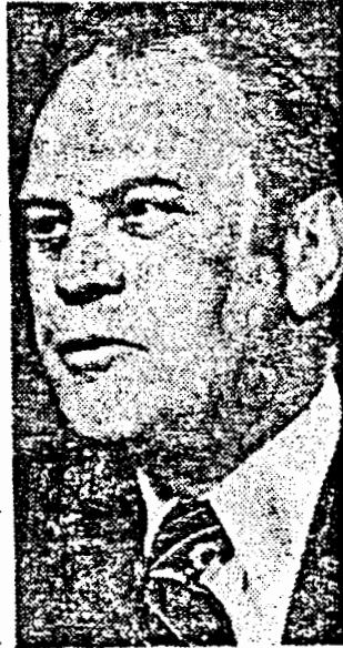
PRESIDENT FORD ... new SAR member

President Ford is now a member of the Sons of the American Revolution.