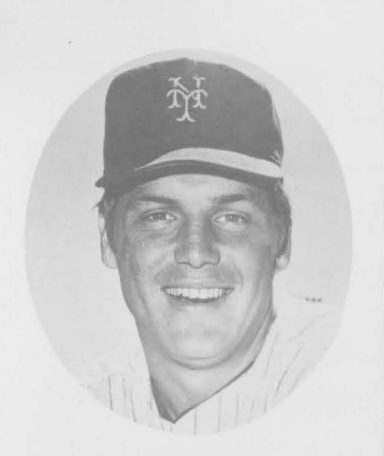
Tom Seaver Sports