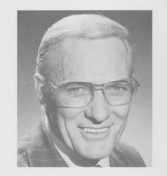
Frank McGee Communications