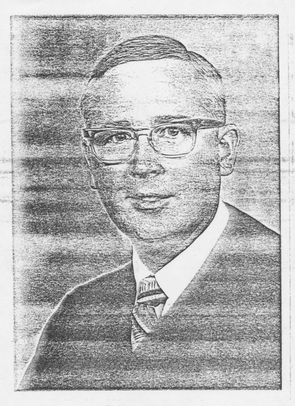
JACK A. KING JUDGE, SUPERIOR COURT NO. 2 OF TIPPECANOE COUNTY LAFAYETTE, INDIANA