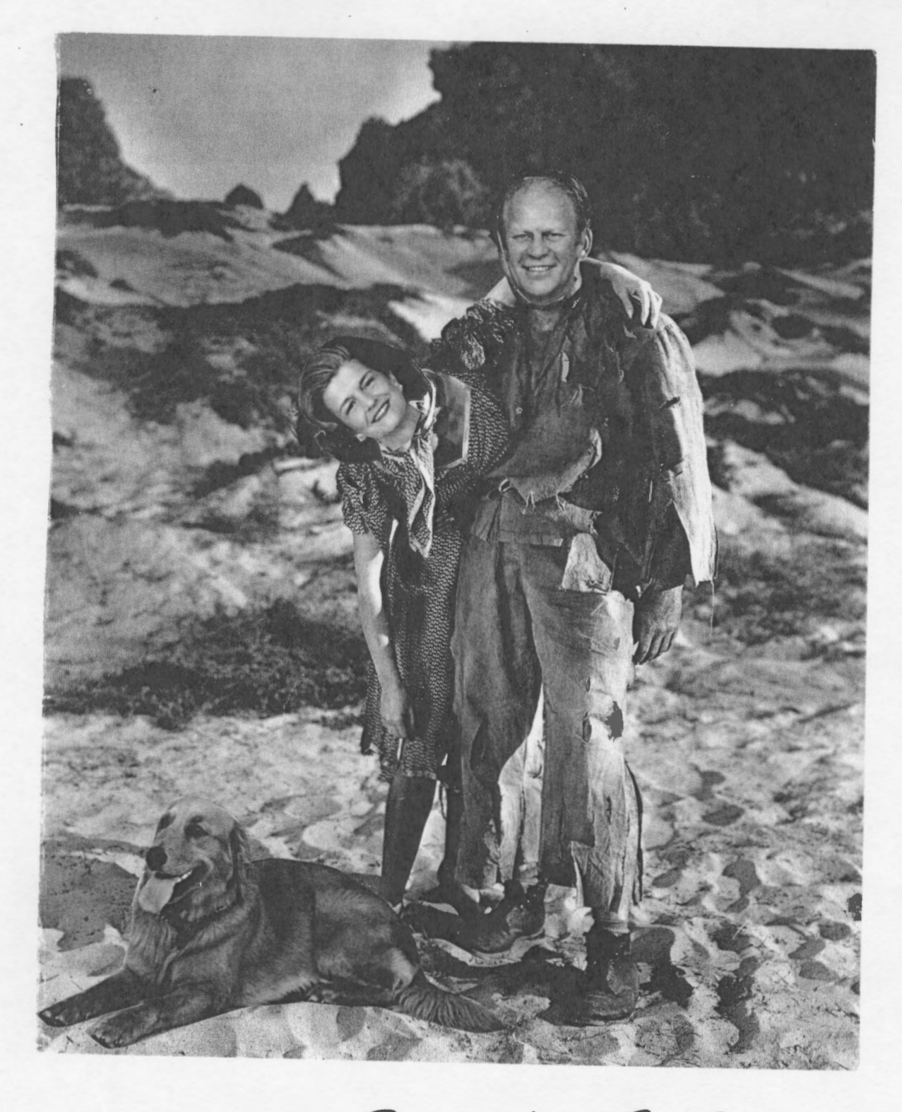
WE'RE READY FOR FOUR MORE YEARS