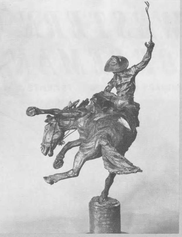
• Two views of the minutely detailed sculpture by Harry Jackson.