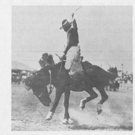
Two photos taken in 1907 show the head-down, stiff-legged style of bucking that was so hard on riders who tried Steamboat.