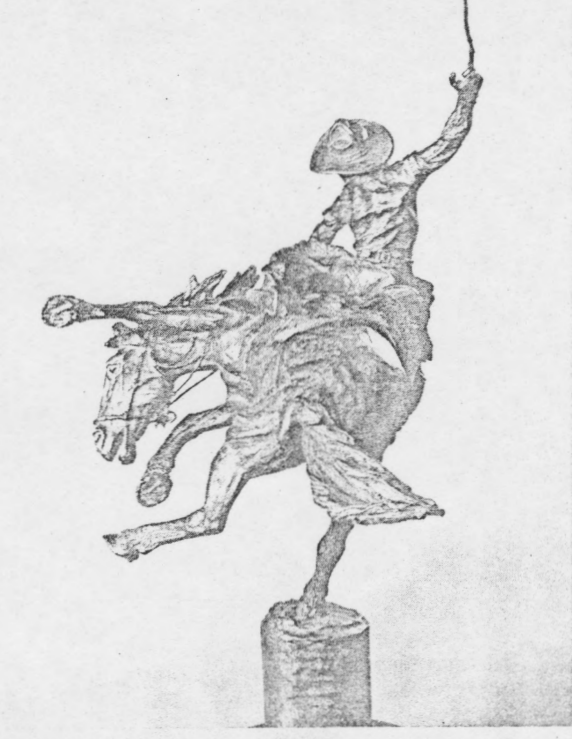
. Two views of the minutely detailed sculpture by Harry Jackson.