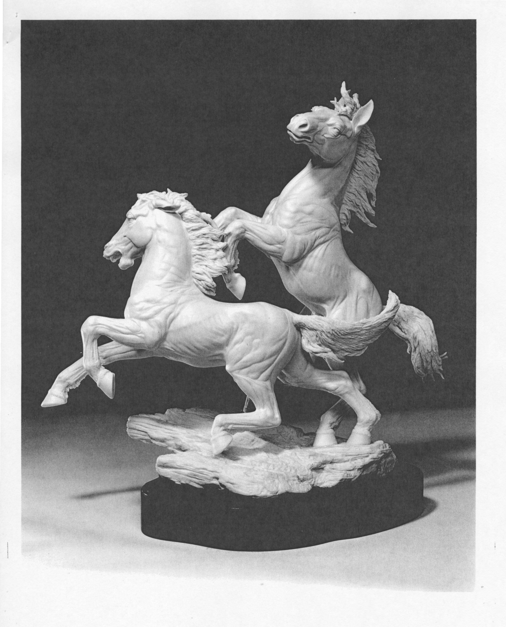
WILD AMERICAN MUSTANGS Porcelain Sculpture by the Edward Marshall Boehm Studios 20"H x 19"W x 10½"D