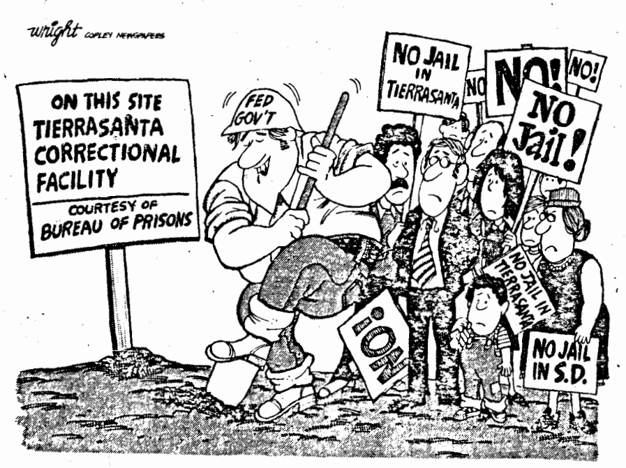
'Thanks For Standing Behind My Decision!'