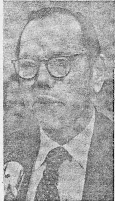
SEN. ROBERT TAFT

The latest Focus, a booklet published by the Ohio AFL-CIO, carries a two-page spread praising Metzenbaum's one-year record in the Senate