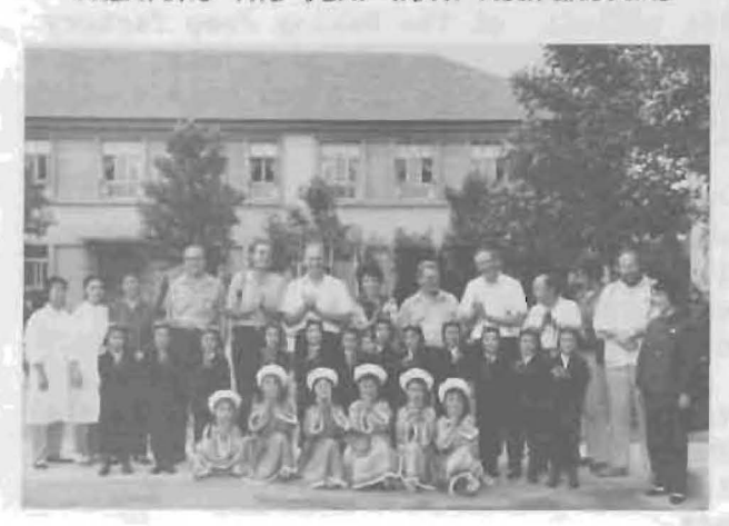
AT CHINESE CHILD CARE CENTER

The advantages of acupuncture anesthesia are that the time of the operation is shortened, the danger is reduced, and the recovery is hastened.