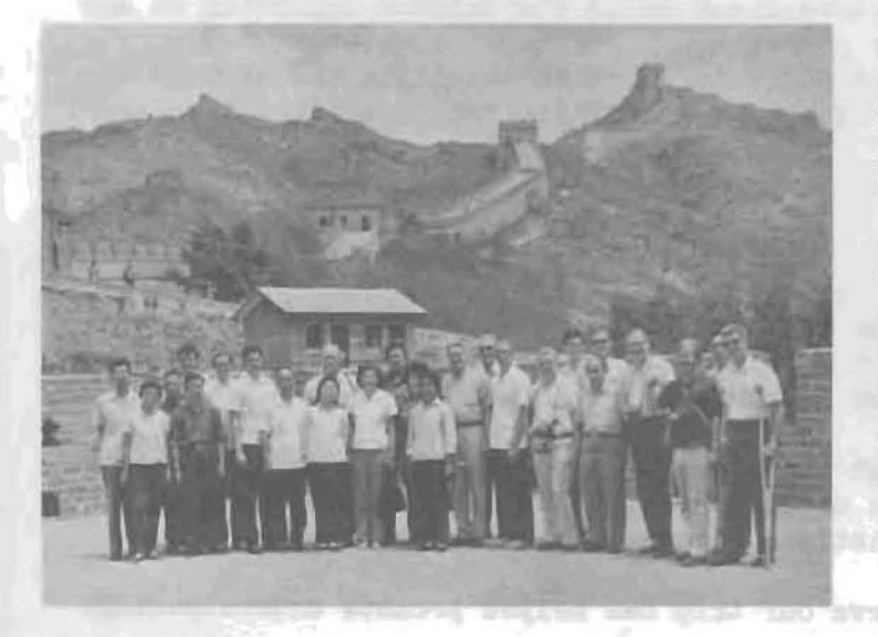
AT THE GREAT WALL OF CHINA

I returned to the United States July 7 after spending nine days in the People's Republic of China. It was an almost indescribable learning experience.