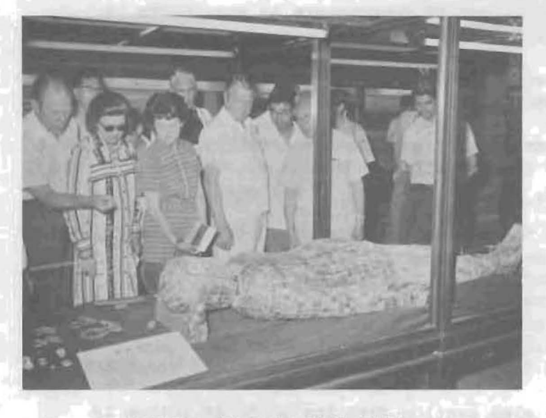
VIEWING ANTIQUE JADE SUIT