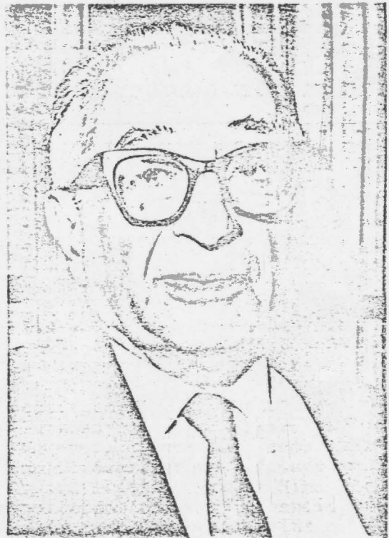
Tsatsos Caps Long Career

He resigned from the faculty of Athens University in 1946 to enter politics. In the course of his political career, Tsatsos has held many ministerial positions, including Minister of the Air Force, Minister of Education, Minister of Social Welfare, and Minister of Health.