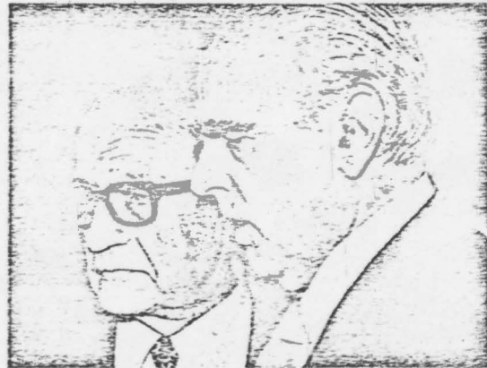
Caramanlis (Right) Differed with Mavros over Constitution

The new Constitution received the required two-thirds majority with the support of the new Democracy Party headed by Prime Minister Constantine Caramanlis. The opposition--the Center Union/New Forces Party (CU/NF) headed by George Mavros and the Pan-Hellenic Socialist Movement (PASOK) headed by Andreas Papandreou--boycotted the vote, but Mavros has indicated that the opposition's abstention did not mean nonrecognition of the validity of the Constitution. Mavros has called for revisions of the Constitution while Papandreou has called for a new constituent assembly to draft a new Constitution. In attacking the Constitution, the opposition has charged that it grants