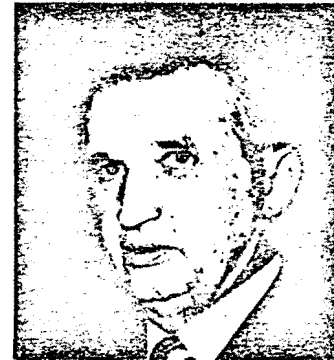
Ceausescu Seeks Nonaligned Coloring

These principles, which reflect the Romanian position in the ongoing CSCE talks, constitute a retort to Soviet claims of the right to intervene in the internal affairs of another socialist state. Also, they serve as a reminder of the still outstanding, though unspoken, territorial issues related to Transylvania, Bessarabia, and Northern Bukovina.