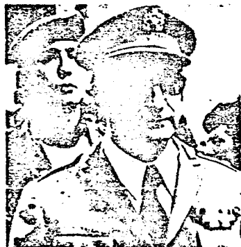
Costa Gomes Visited Bucharest

Romania has once again shown its proclivity for the different by becoming the first Warsaw Pact country to sign a Treaty of Friendship and Cooperation with a member of NATO, Portugal. The treaty brings together the two mavericks of the Eastern and Western military alliances.