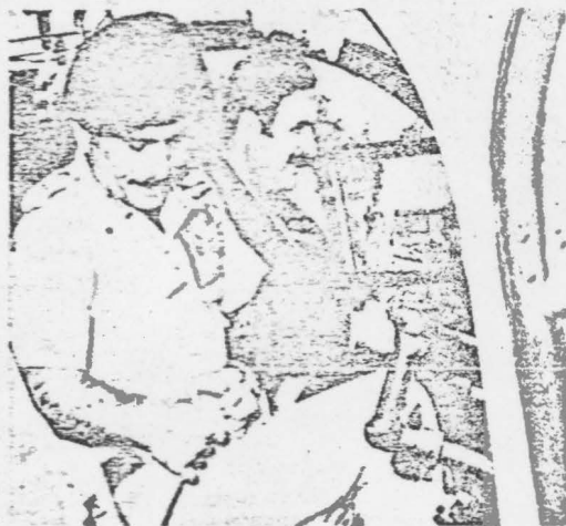
Hussein and Asad Take Off Together

Syrian President Asad visited Jordan June 10-12, the first Syrian chief of state to do so in 18 years. The visit caps a phase of rapprochement in the often troubled relations between the two countries. It reflects Asad's efforts to improve relations with Arab countries with whom his predecessors had been at odds, as well as Jordanian efforts to improve relations with nearby Arab countries.