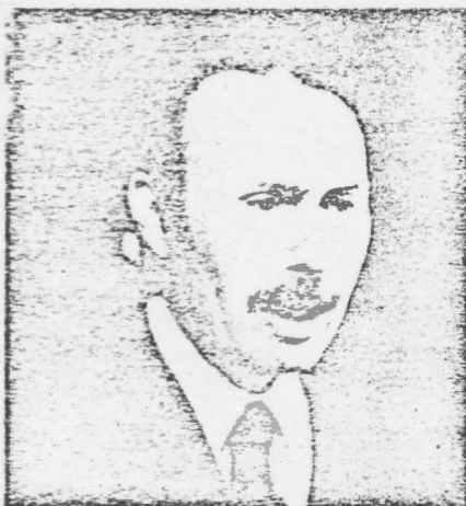
Boumediene's Move Was Unexpected

On June 19, in a speech marking the 10th anniversary of the coup which deposed Ahmed Ben Bella, President Boumediene announced that presidential and National Assembly elections would be held within twelve months. He said work would begin immediately to prepare for a national congress of the National Liberation Front, the sole political party--presumably to prepare slates of candidates. The last National Assembly was dissolved in 1965 following the coup, and since then President Boumediene and the National Revolutionary Council have wielded supreme power, ruling by decree.