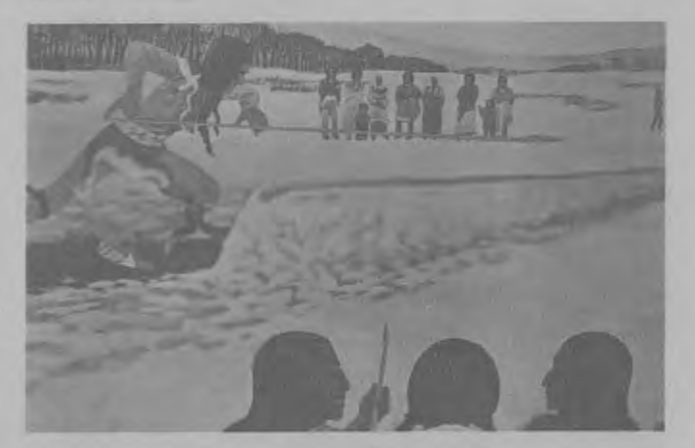
Mural, "snowsnake," traditional Indian sport. Wall mural executive wing, Haley Building

The Seneca Nation of Indians Education Program is a bi-cultural program with emphasis placed on both scholastic improvement and instruction in traditional Seneca arts and crafts. Scholastic improvement through tutoring is done in the Salamanca Central School District, the Gowanda School District and the Silver Creek Central School District for children at the Jr.-Sr. High School level. Seneca language and dancing classes are conducted at the Haley and Steamburg Community Buildings on the Allegany Reservation. On the Cattaraugus Reserve, classes are conducted at the Saylor Community Building. Also included in the Seneca Cultural aspects of the program are wood carving, traditional food preparation and costume making.