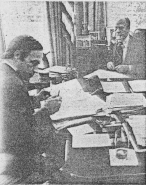
Cheney reviews the day's schedule with the President. "Every morning when you come to work, there are a hundred things you could do that day," he says.

Unfazed by a fall at home which broke a bone in his foot, Cheney props his crutch against an ornate desk built for Nixon chief of staff H. R. Haldeman.