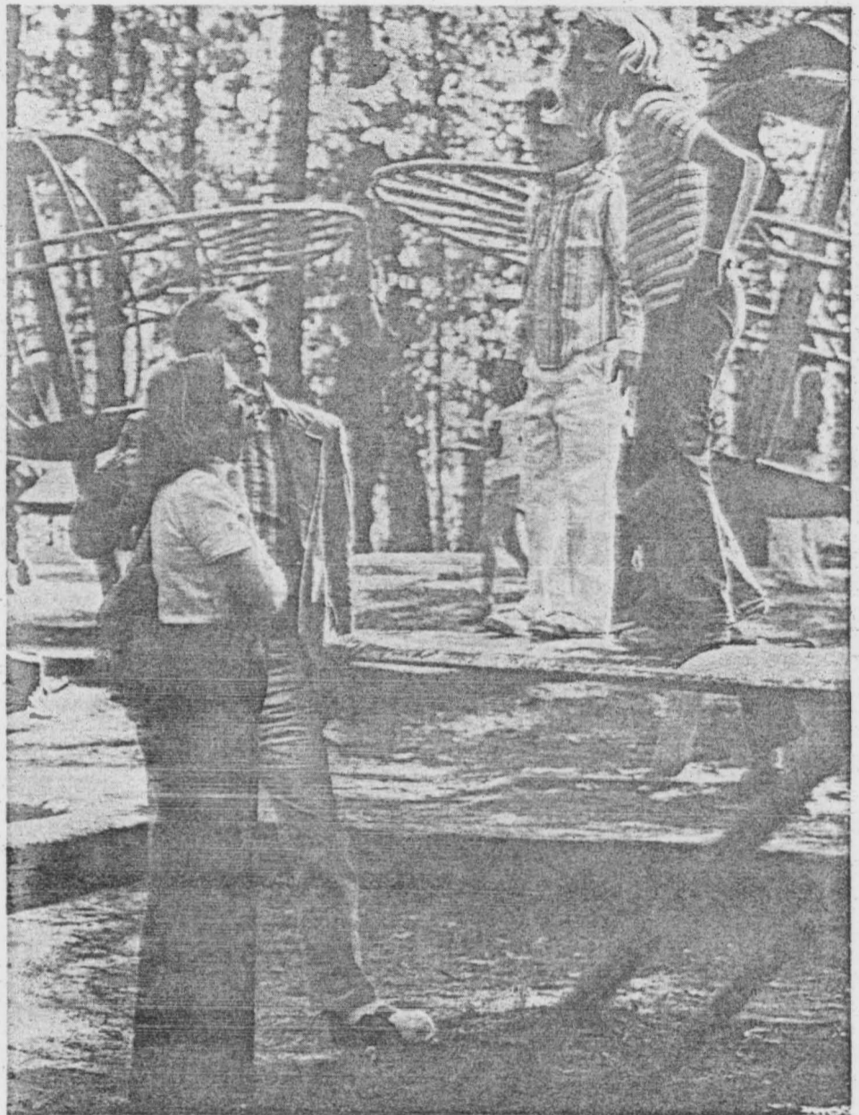
Cheney and wife Lynne have a rare outing in a Bethesda park with daughters Mary, 7, and Liz, 9. The campaign has made his office hours even longer.

Cheney worries about not seeing enough of his two young daughters. On