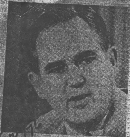
8/23/76 HOWARD CALLAWAY Yields to pressure