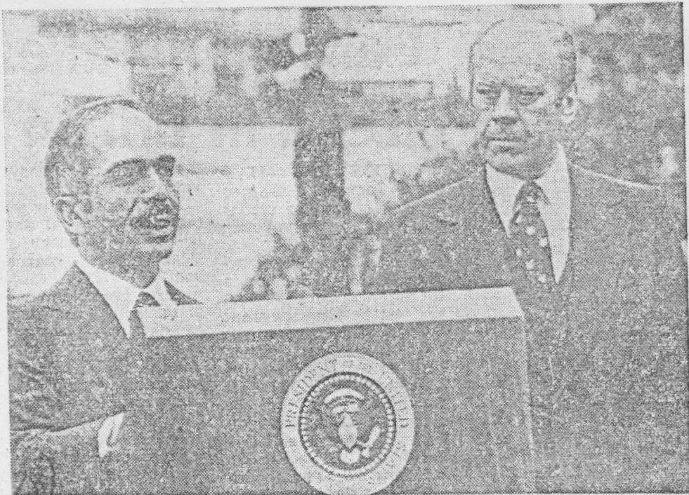
King Hussein of Jordan and President Ford on the White House lawn today.