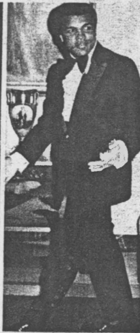
King Hussein's daughter, Princess Alia, and Kissinger; Hussein and President Ford; Muhammad Ali

FAN FARE: Even an outspoken First Lady has difficulty keeping Gerald Ford in line. Coming down the Grand Staircase with King Hussein and Queen Alia of Jordan in the White House in Washington Tuesday night, the President broke ranks, headed out in front of the color guard and ended up with a face full of tassels. "I told you so," Betty Ford said. Henry Kissinger was on hand, beaming except when reminded of "The Final Days," the new Woodward-Bernstein book. Henry said of the movie version of the first book, "All the President's Men," "I don't want to see it and I'm not going to." Meanwhile, Charlton Heston, asked his views on the Supreme Court ruling which upheld state laws against homosexuality, lapsed into his Moses routine to announce, "I am not a homosexual. I couldn't get all that exercised about it. I haven't spent a lot of time thinking about it." He'd obviously thought about "Cuckoo's Nest" winning five Oscars, though. "Ben Hur" won 12," he pointed out.