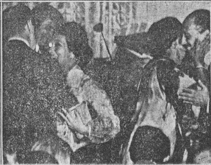
Pearl Bailey and President Sadat dance together as President Ford dances with Mrs. Sadat at White House dinner Monday.