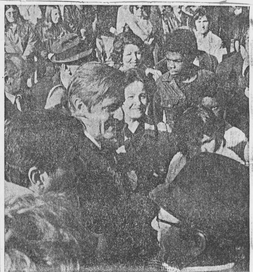
STANDING OUT IN A CROWD — Person-to-person campaigning occupies Sen. Walter F. Mondale as he chats with the crowd along the parade route.