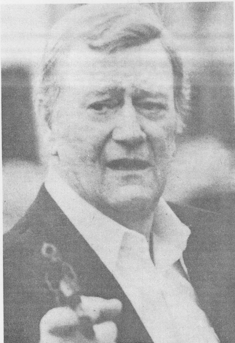
Big John Wayne: No go for porno.

Before his fight last week with Jimmy Young , Muhammad Ali took time out from training to enter into some verbal sparring with reporters and Susan Ford . "You're so damn home," Ali