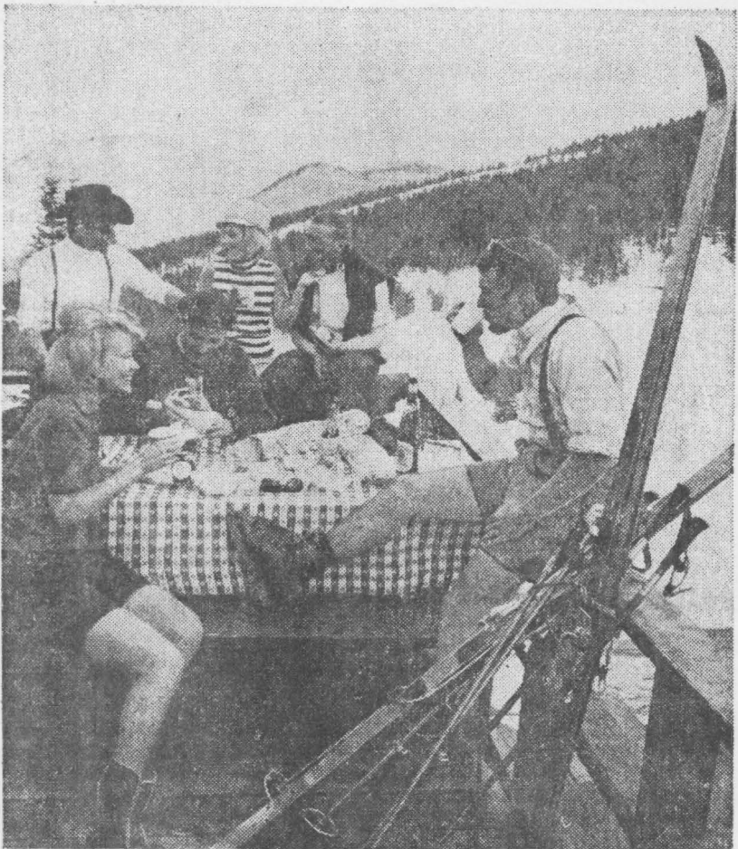
APRES SKIING—Skiers relax after day on Vail's mountain.

He got hooked by the scenery and later returned as a civilian to survey the land. What formerly was a sheep