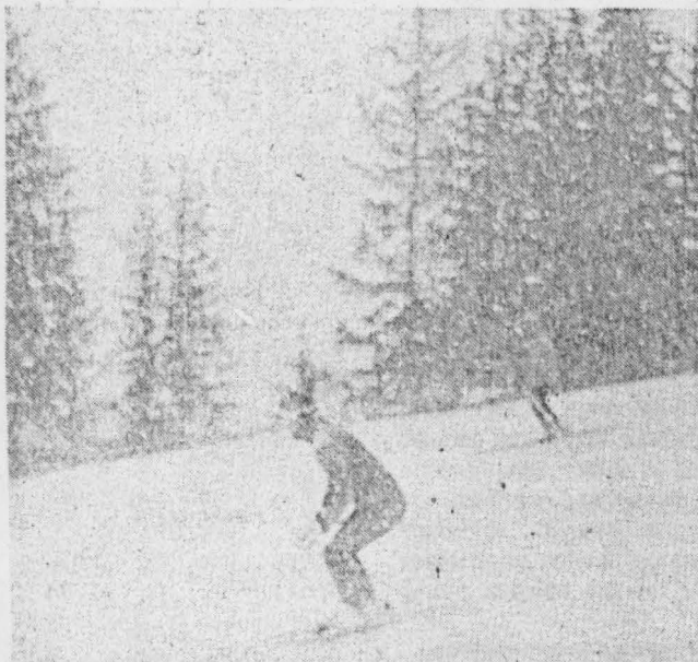
The "exclusive" photo. by Peter Eichstaedt