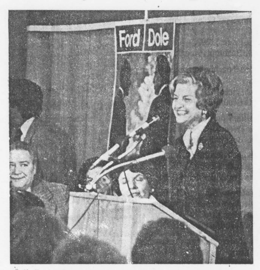
Betty Ford addresses the Lakewood Republican Club at Lakewood City Hall.