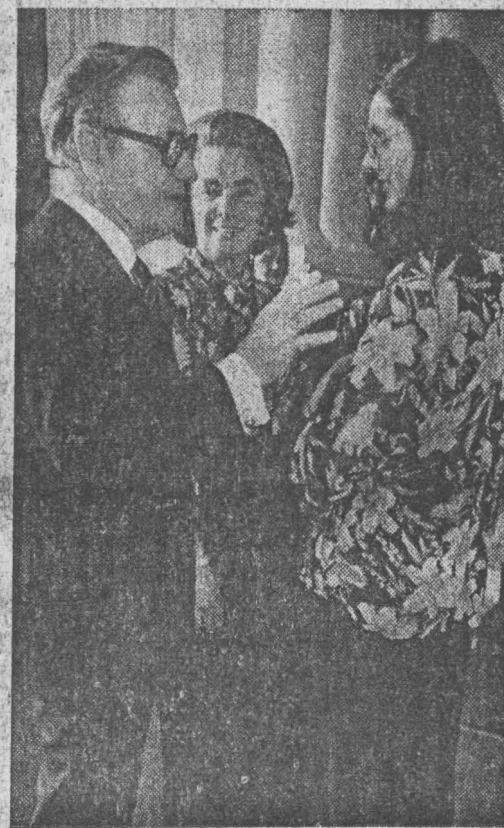
Iranian Ambassador Ardeshtir Zahedi with David and Julie Eisenhower, left; Pat and Luci Nugent with Vice President Nelson Rockefeller, center, and Vice President and Mrs. Rockefeller with Lynda Robb at the Admiral's House reception last night.