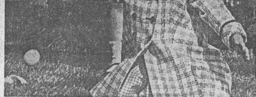
—Washington Star Photographer Joseph Silverman