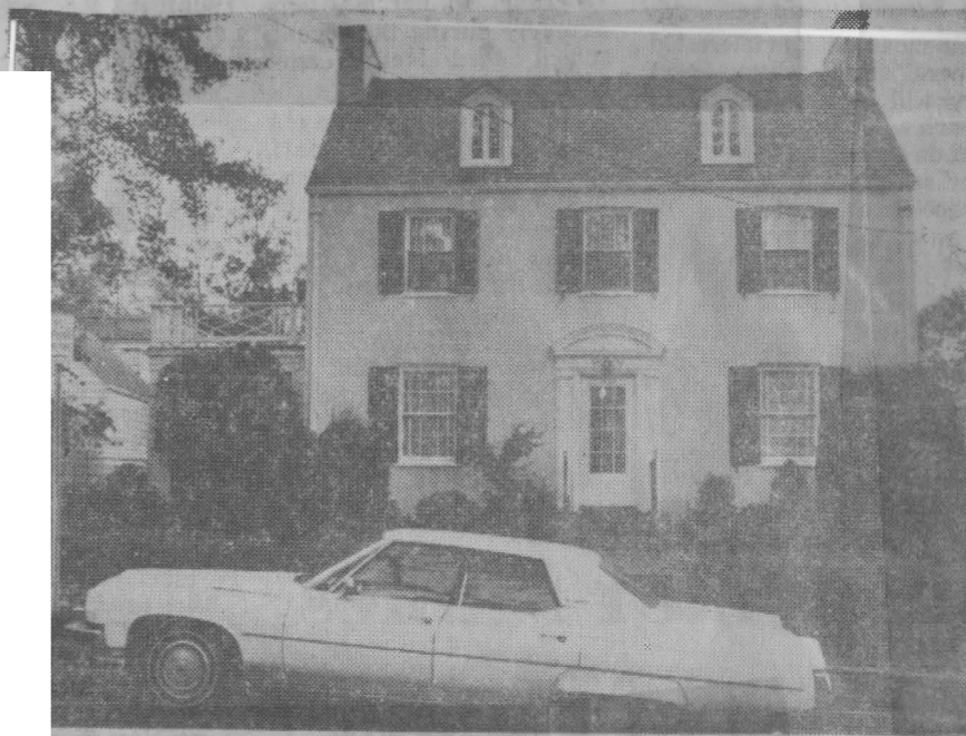
The Washington Post

comes by and puts a ticket on his (Stennis') car."