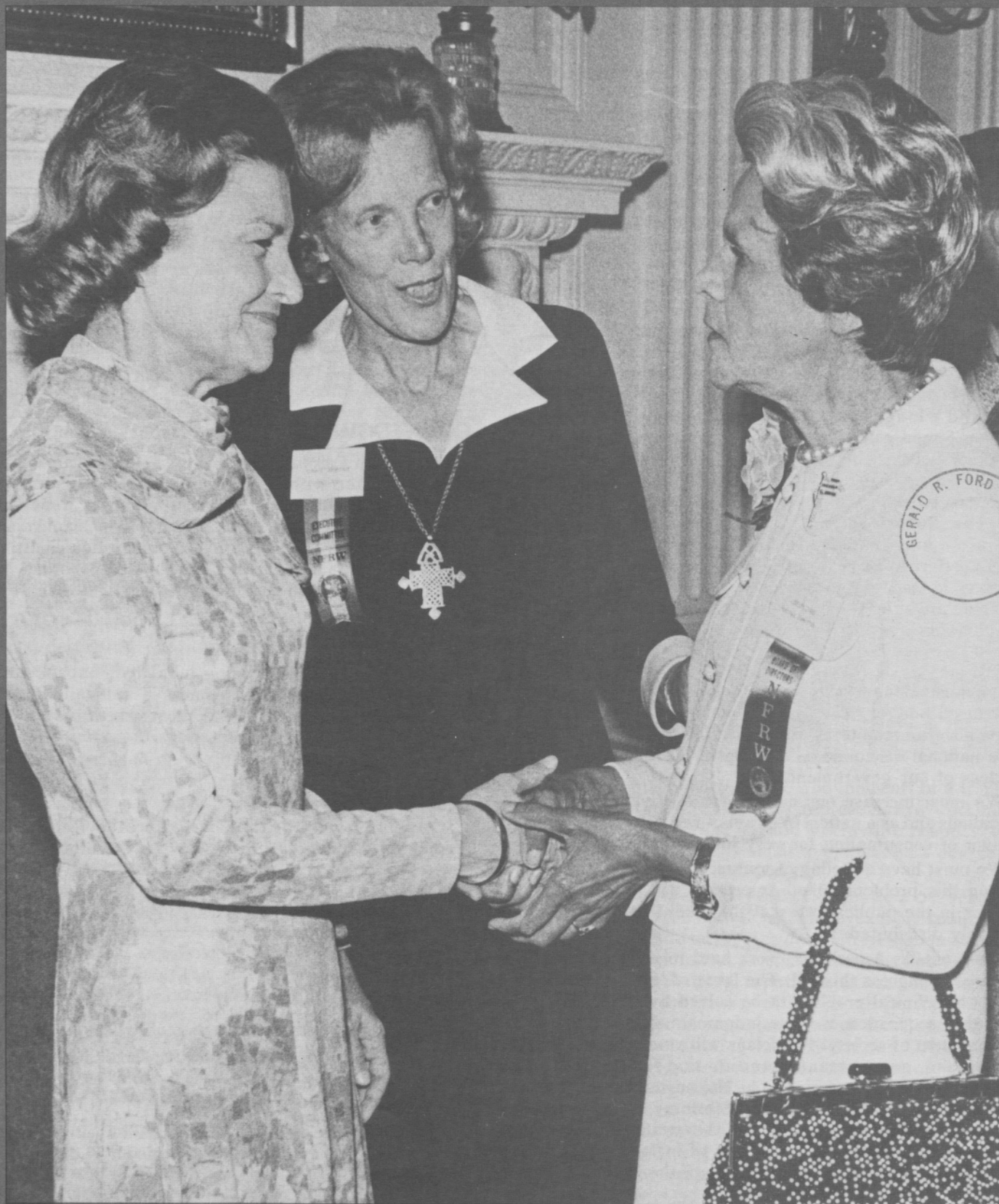
NFRW White House Tour