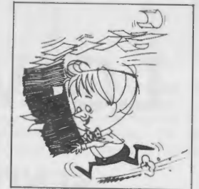
"Getting Info To Members"