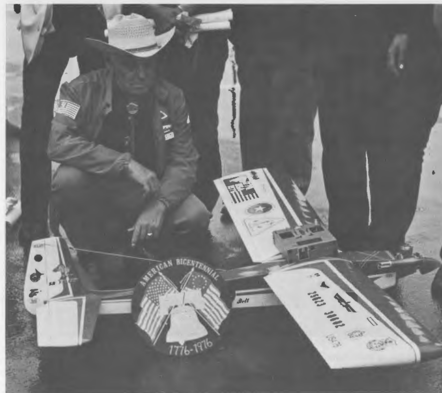
This shows a close up of the plane and one of the members of Tri City Alert Team (He sure ought to have a good view from there).

Boy won't you like to go 3000 miles on 16. gallons of fuel.