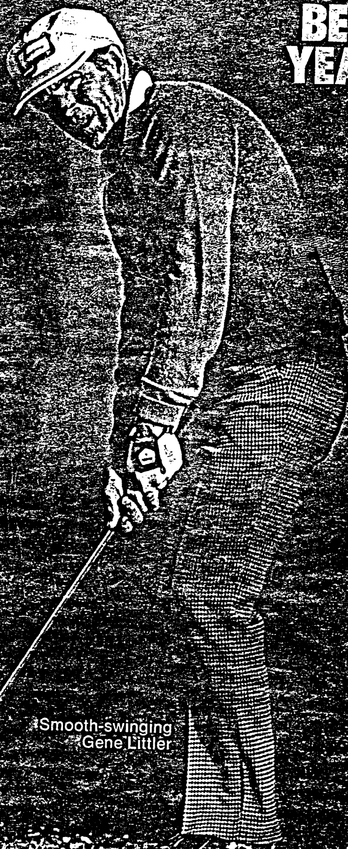
Smooth-swinging Gene Littler